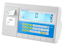
AE 504 Indicator