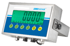
AE 403 Indicator