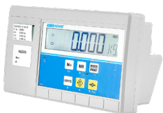
AE 503 Indicator